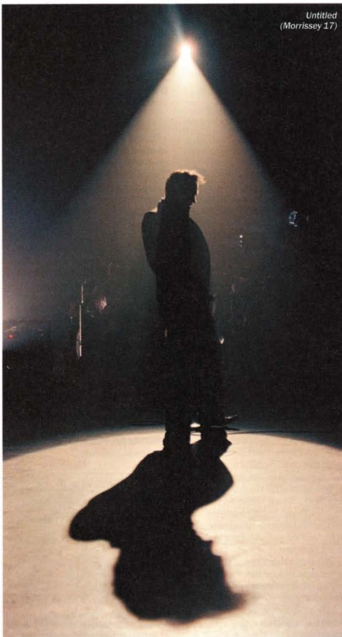
Untitled (Morrissey 17)

Twenty color photographs are mounted on foam core and placed behind glass in frames that nearly resemble vitrines. The images are saturated with flamboyant blues, oranges and yellows, as if seen through the multihued gels of theatrical lighting. Fan after fan stands slightly agog at the spectacle onstage, exhibiting no glee, no rapture, but simply earnest absorption. Art historian Michael Fried famously argued that the most successful art presents its subjects in a state of oblivion regarding audience; any direct, frontal engagement breaks the hermetic serenity of the scene and contaminates it with an objectionable air of self-conscious theatricality. McGinley follows a Friedian line here, skulking